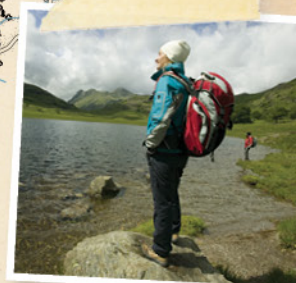
Taking in the views, Blea Tarn